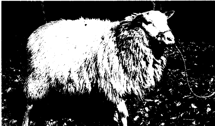
NINE MONTH OLD ANZAR RAM LAMB

Top quality registered pure white Finnsheep. Ewe and Ram lambs for sale.